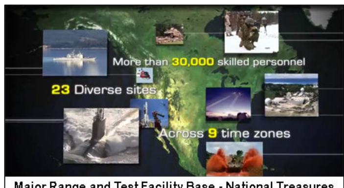
Major Range and Test Facility Base - National Treasures

The 2007 Department of Defense Directive NUMBER 3200.11 identifies the Major Range and Test Facility Base as the designated core set of DoD Test and Evaluation infrastructure and associated workforce that must be preserved as a national asset to provide T&E capabilities to support the DoD acquisition system.