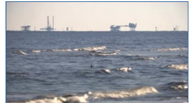
Oil Rigs in Louisiana State Waters