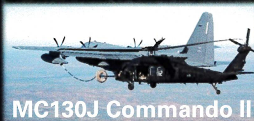
MC130J Commando II