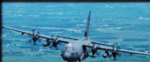
AC130J Ghost Rider